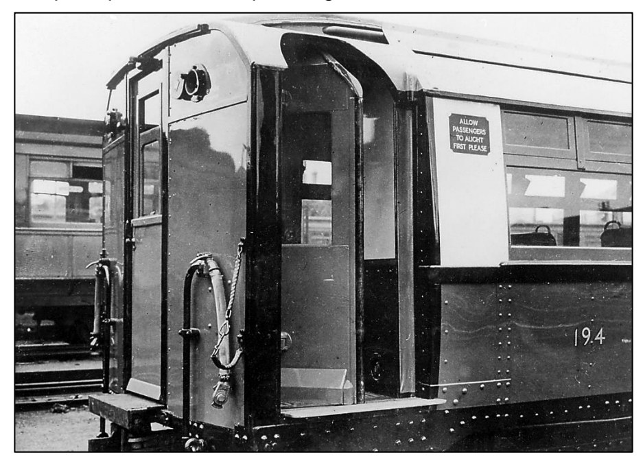
Figure 3: Close-up of the enclosed end of Hampstead gate stock Car No.194 showing the revolving door trial proposed by W.S. Graff-Baker. Only this single door position was fitted with this type of doorway. All the other doors were of the conventional sliding type. The position of the door engine is not indicated in this photo, nor in the general arrangement drawing of the vehicle.

into the bodyside to receive the open door. It also removed the need to place the door engine in the cramped space behind a passenger seat.