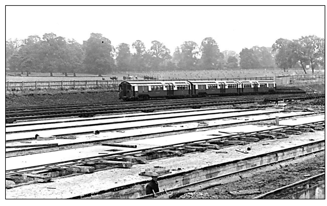
Figure 1: Morden depot about mid-1925, showing three 1924 Met. Carriage motor cars stored on No.1 road after delivery. depot is a long way from complete. They have dug the pits and concreted some of them but they haven't put up any of the building structure Storing cars for long periods leads to quite rapid deterioration and I suspect some cars needed work before they were fit for service.

Although some 7-car trains (actually only 7 out of a total of 42 peak hour trains operated) had been introduced with the opening of the Edgware extension on 15 August 1924, the entry into service of new cars seems to have been slow and probably didn't match the dates recorded. I suspect this was due to modifications, particularly to the door control system, which did give some problems during the early years of operation. There were probably also problems with storing and maintaining the new cars (Figure 1).